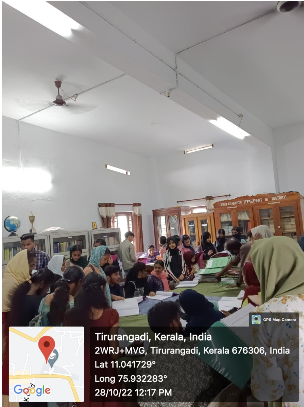
PROJECT ANALYSYS AT PSMO COLLEGE