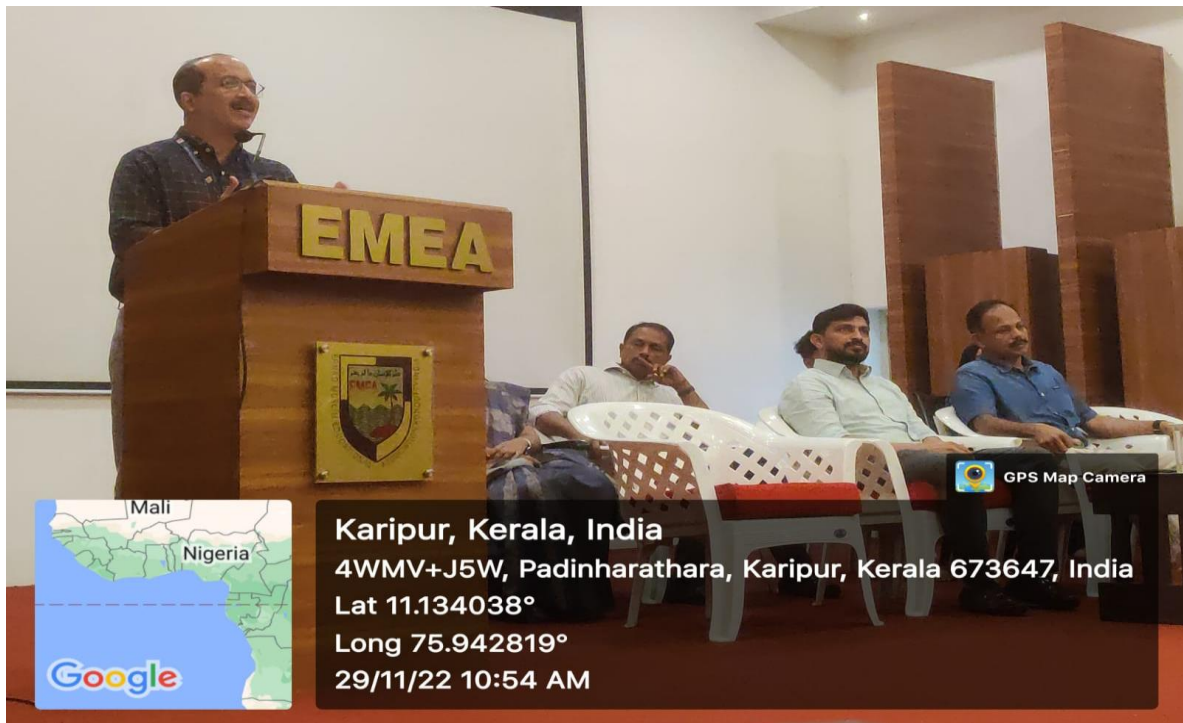
Inauguration by Pro- vice chancellor