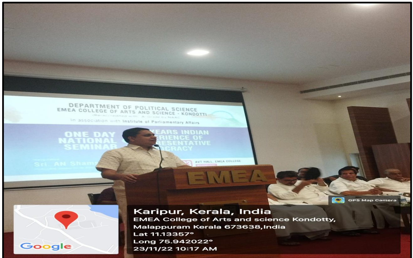
Inauguration by the speaker