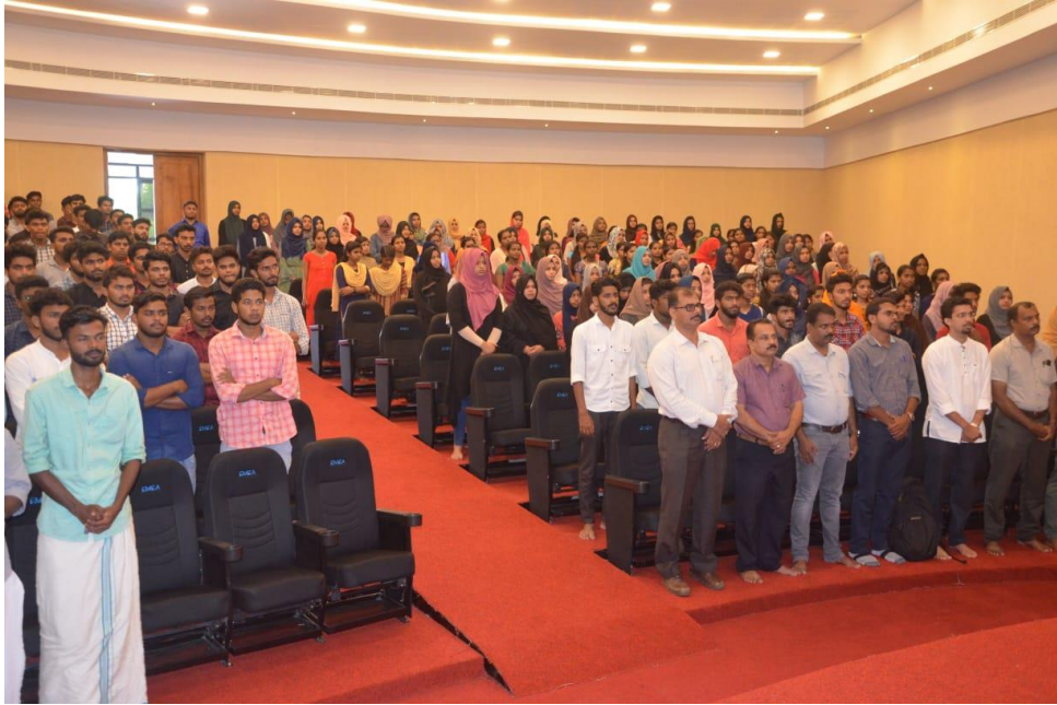
Prayer moment in the induction programme