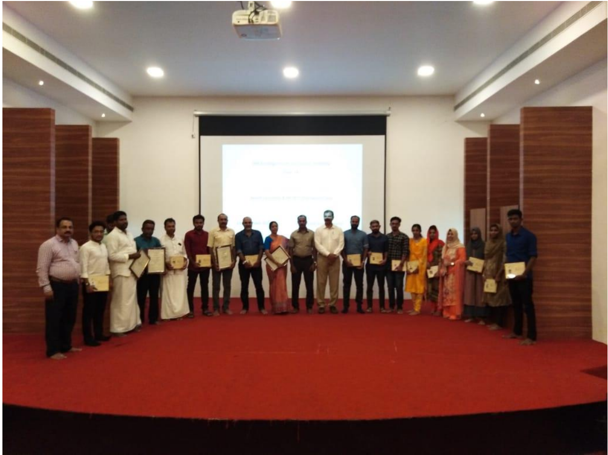
NET Holders with Principal and IQAC Co-ordinator