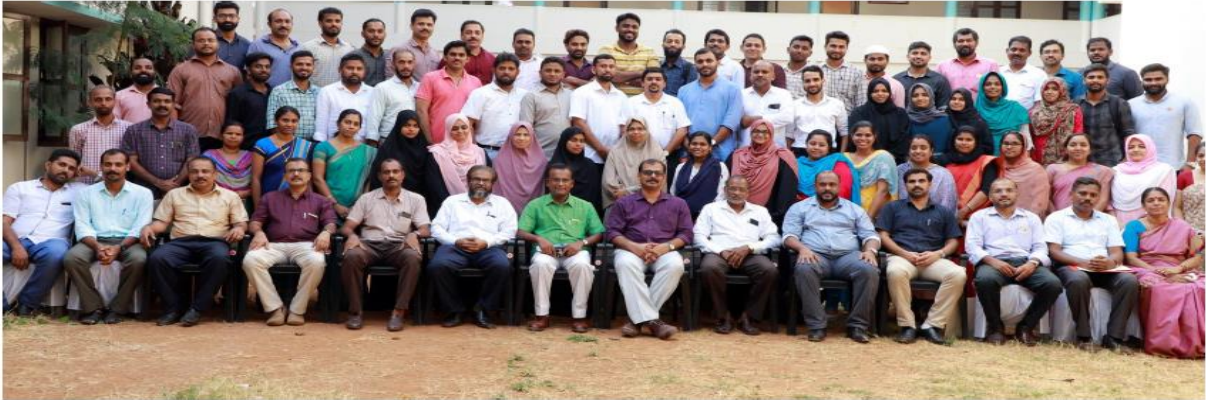
Group Photo of participants with the Chief Guest on the Valedictory Day

News Reports on Calem on Suprabhatham daily, Madhyamam daily and Chandrika daily respectively