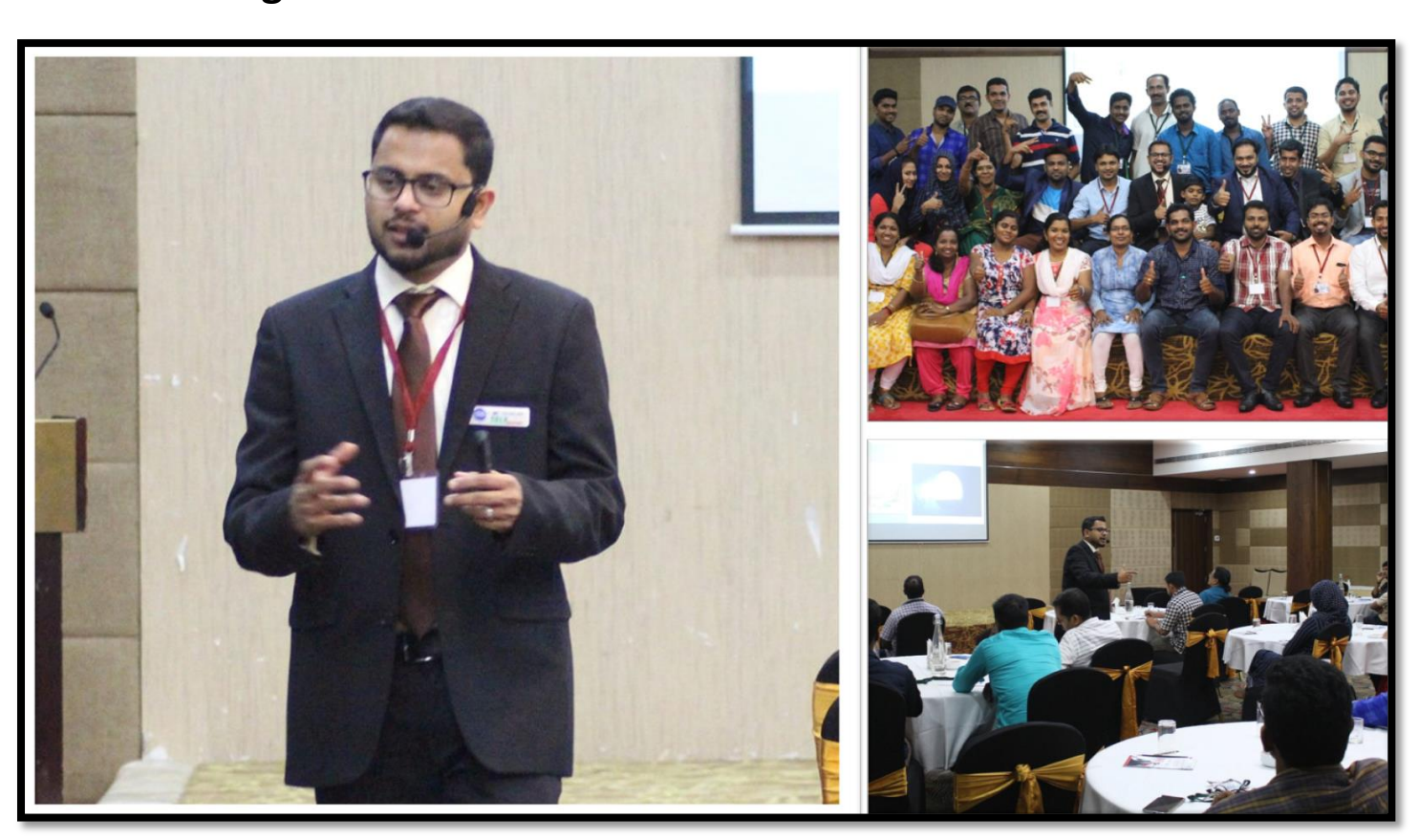
Training Jeddah . Saudi Arabia