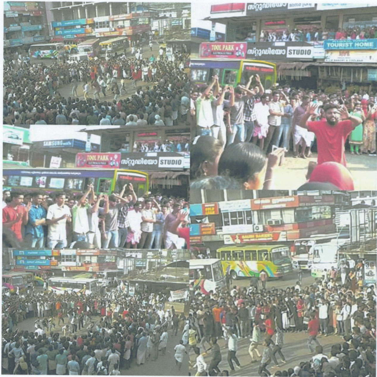
Flash @Kondotti Muncipal Bus Stand