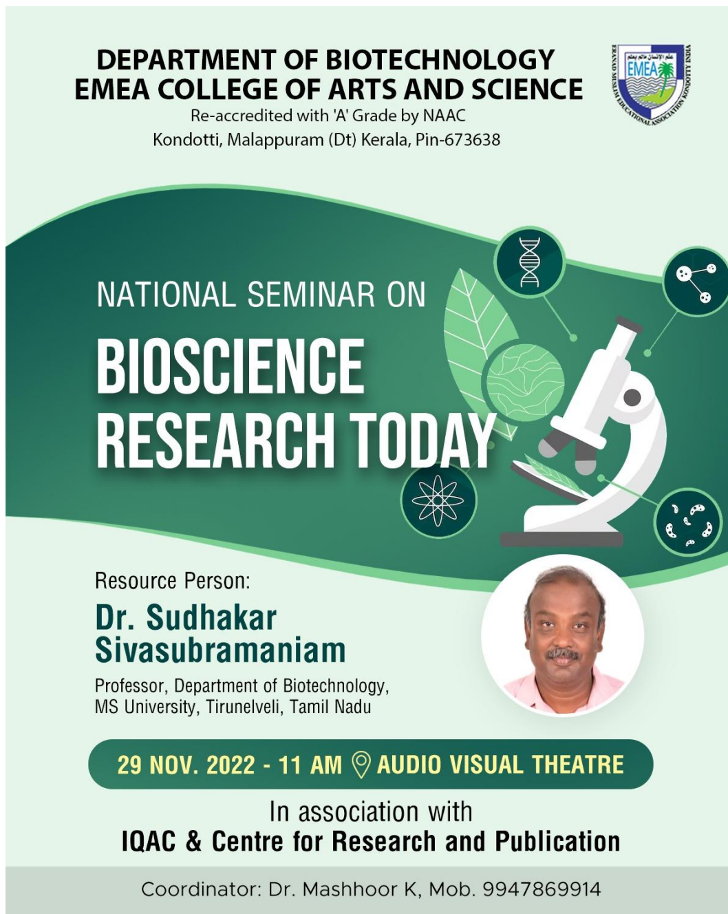
Flyer of the Programme