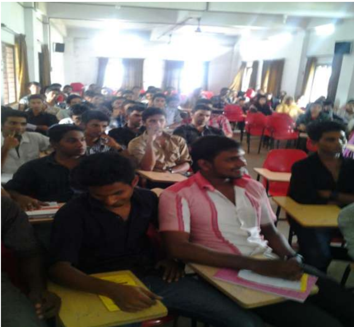
Students attending the PSC Awareness Class