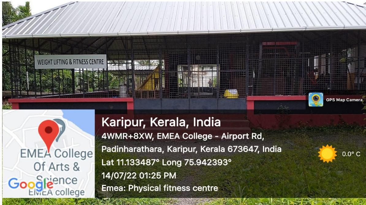
Physical Fitness Centre

Ph: +91 483 2712030 | 2713530 | 2715020 | Fax: +91 483 2713530 Email: mail@emeacollege.ac.in | www.emeacollege.ac.n