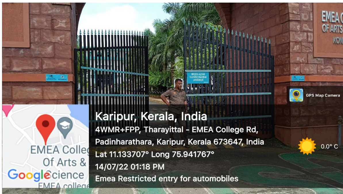
Security in Main Gate