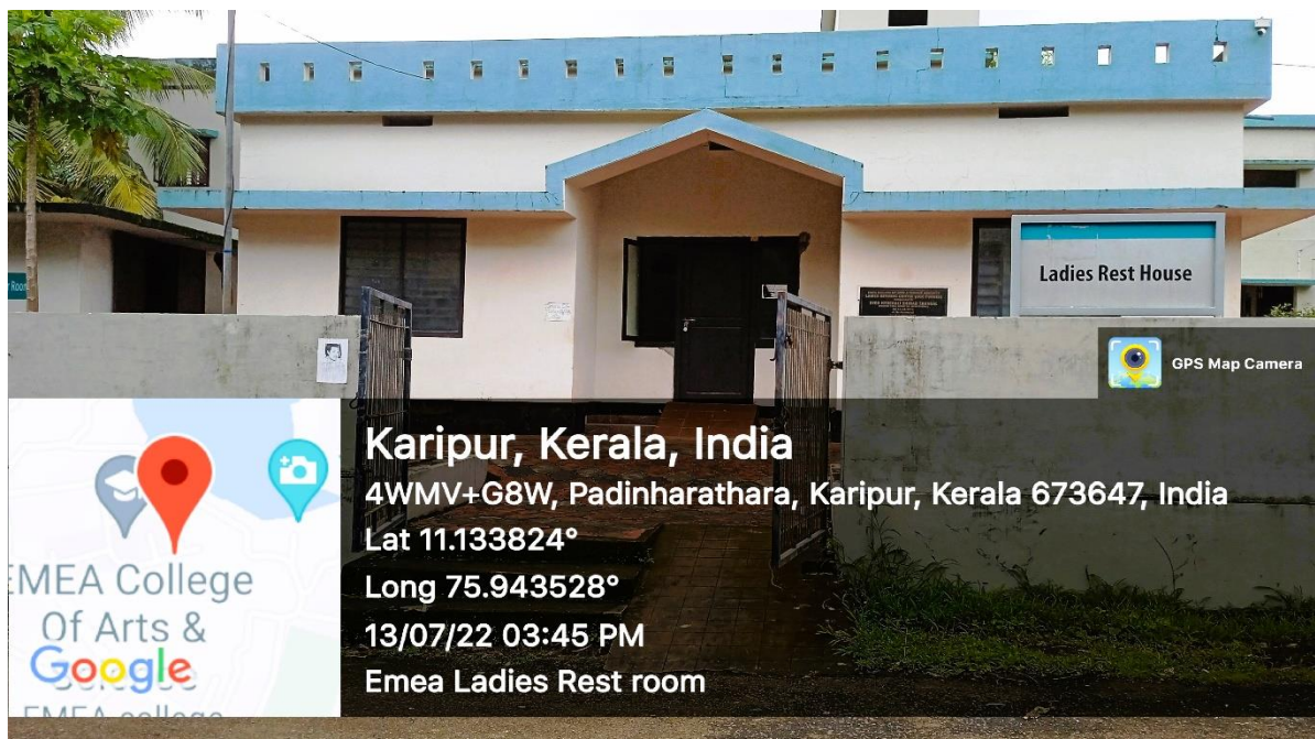
Ladies Rest Room