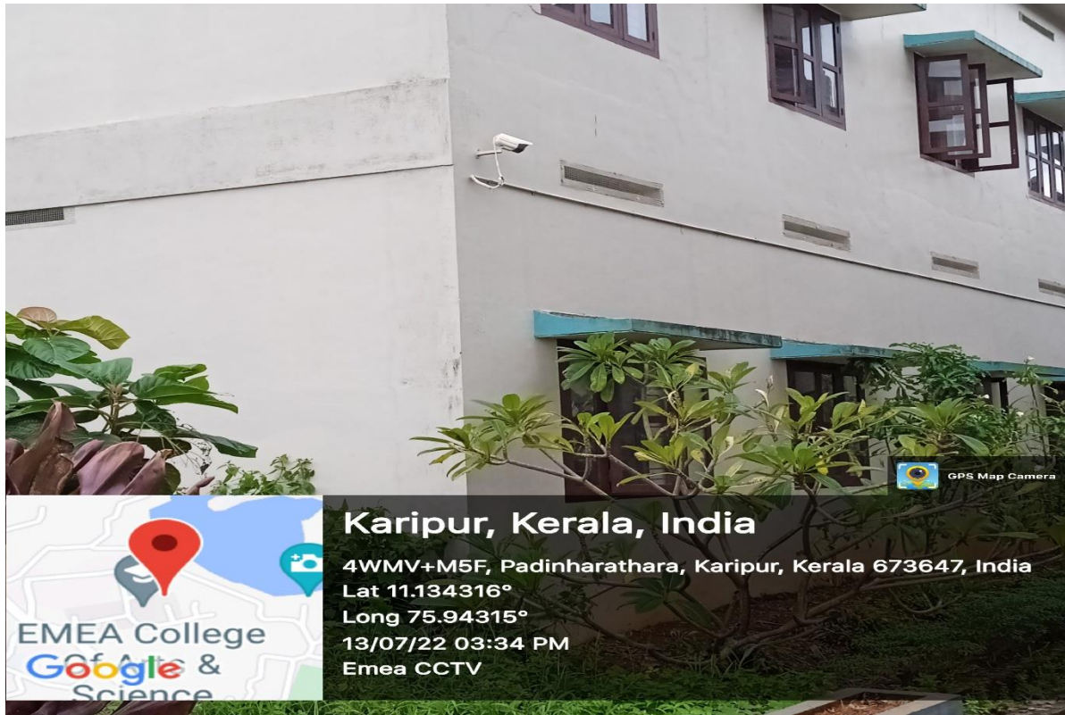
CCTV Camera at front side of main block

Ph: +91 483 2712030 | 2713530 | 2715020 | Fax: +91 483 2713530 Email: mail@emeacollege.ac.in | www.emeacollege.ac.in