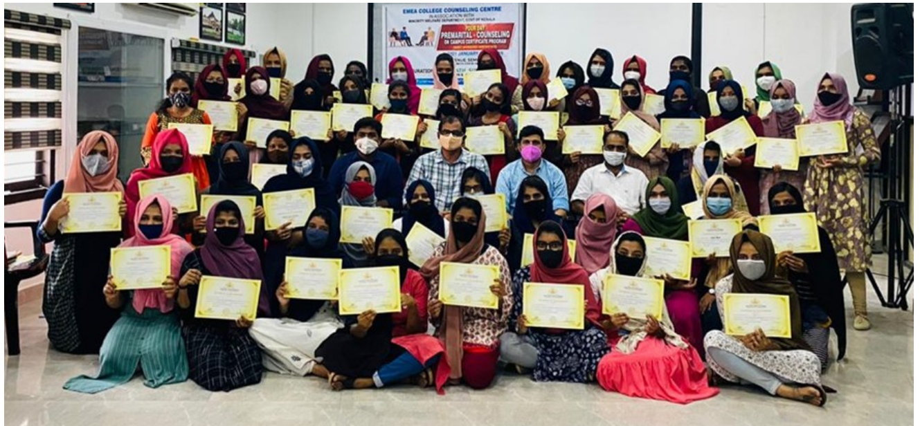
Group Photo of the Participants (Jan13-16, 2021 Batch)