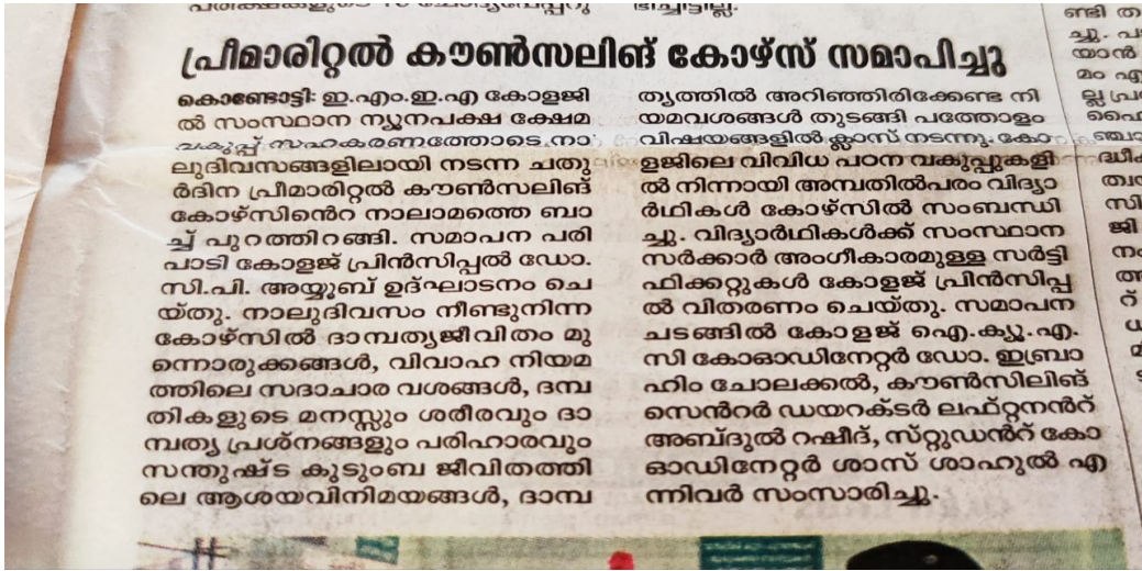
Suprabhatham Daily 18/0/2021