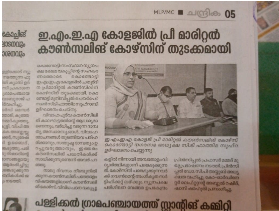
Chandrika Daily 14/01/2021