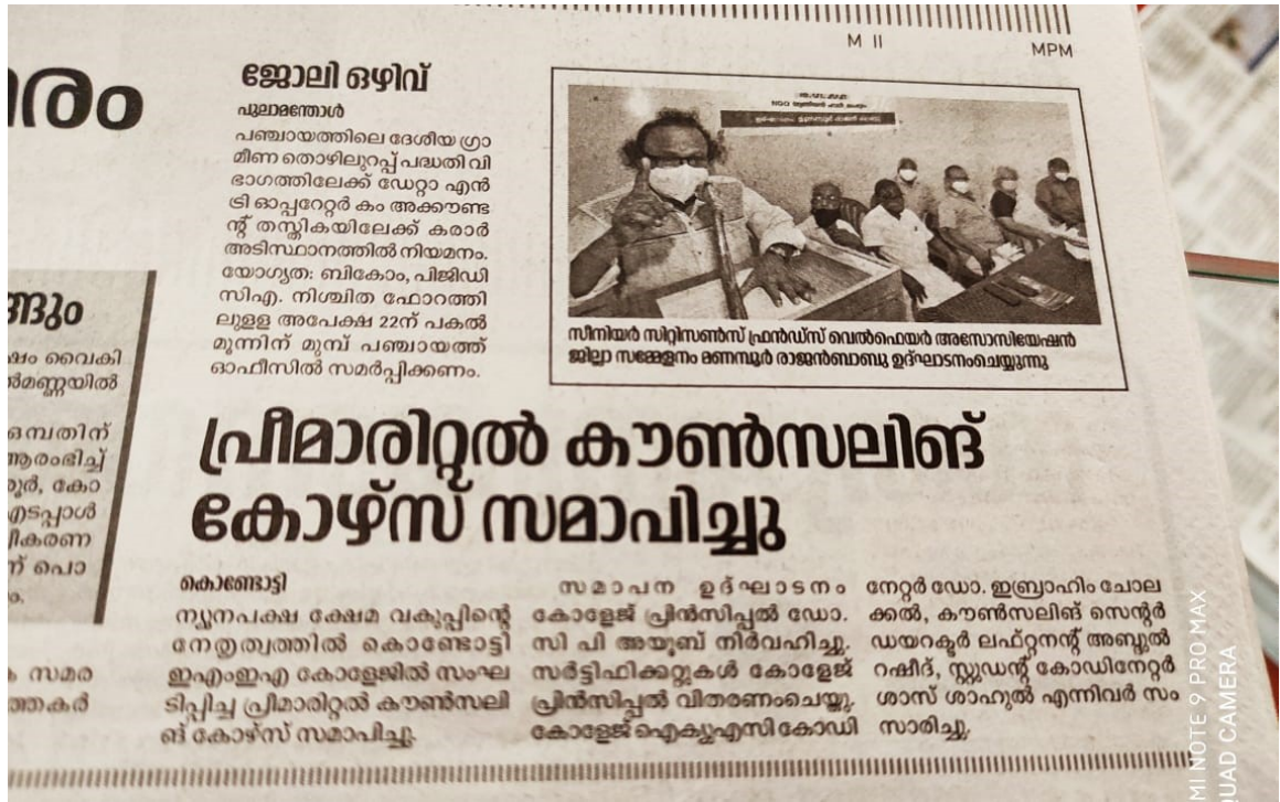
Deshabhimani Daily 18/0/2021