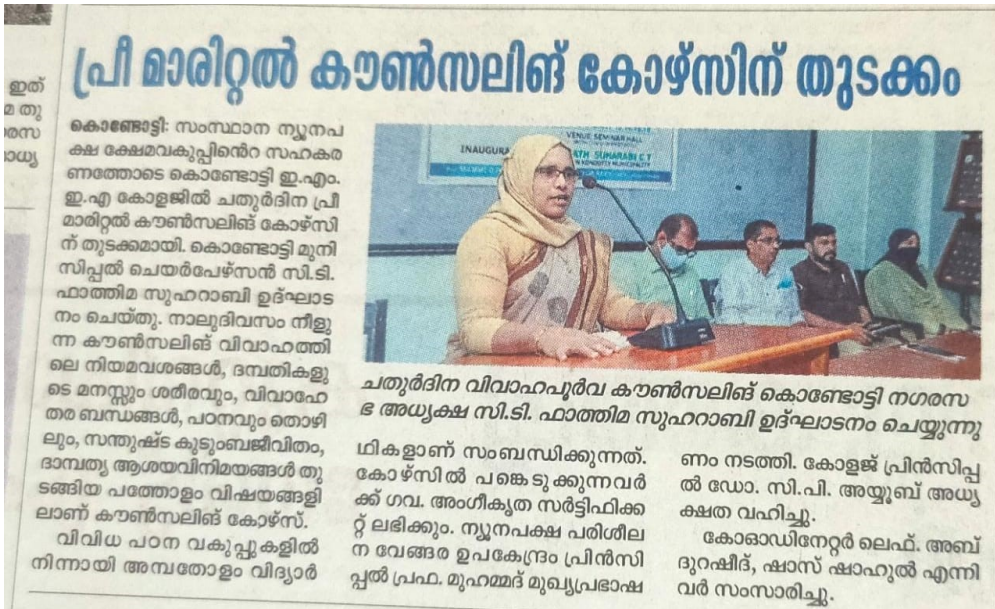
Madhyamam Daily 14/01/2021