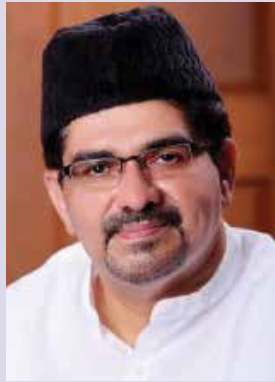
Sayyid Basheer Ali Shihab Thangal