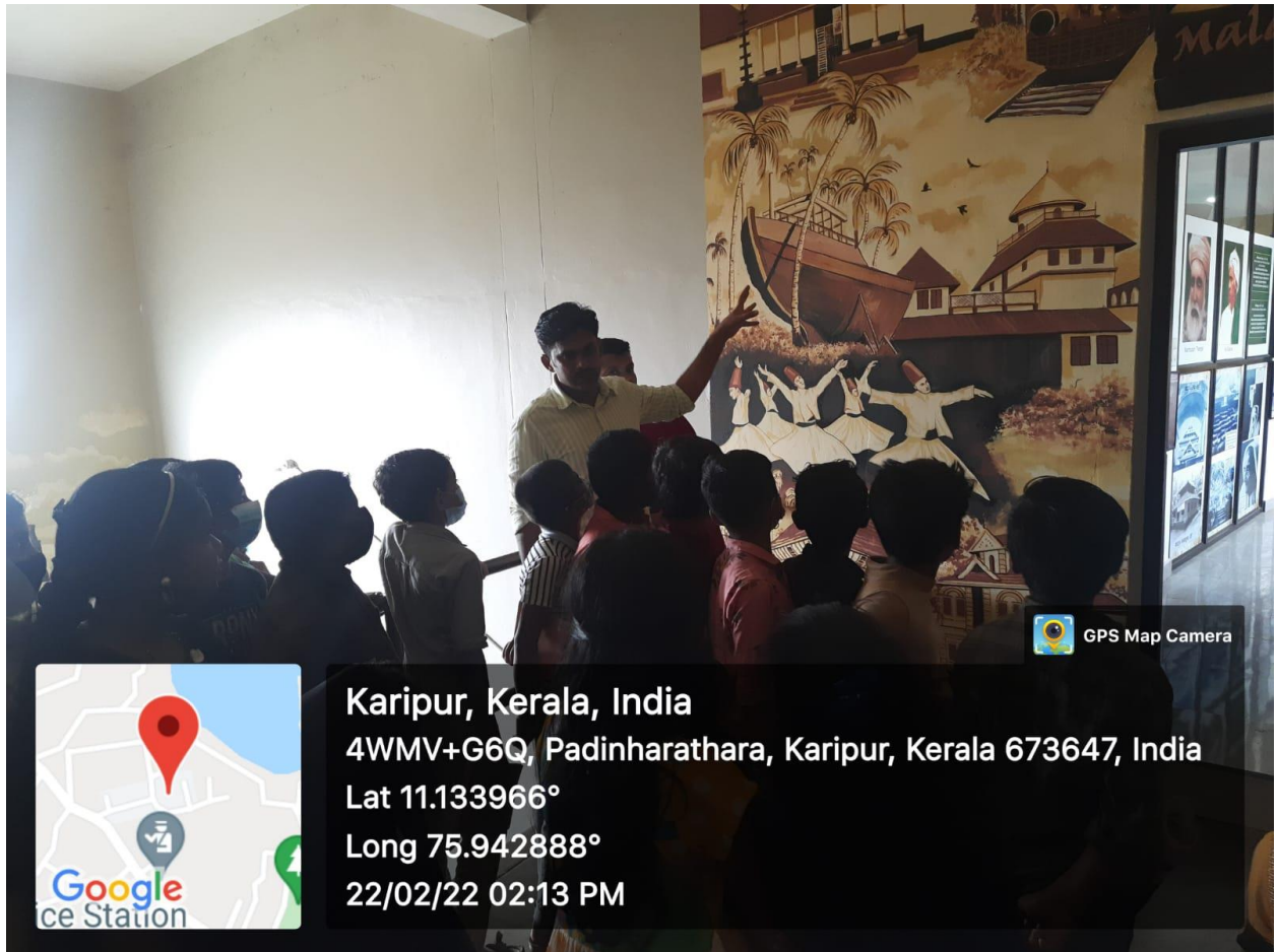
Wall Painting Explannation