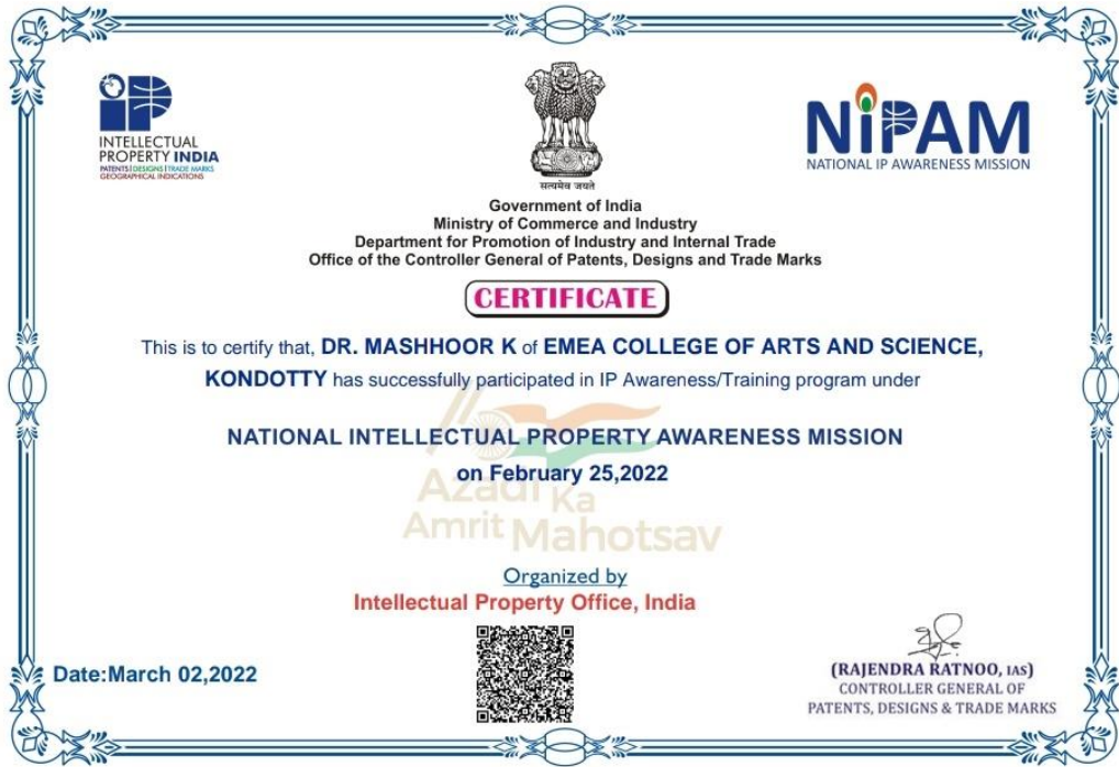
Certificate of Participation