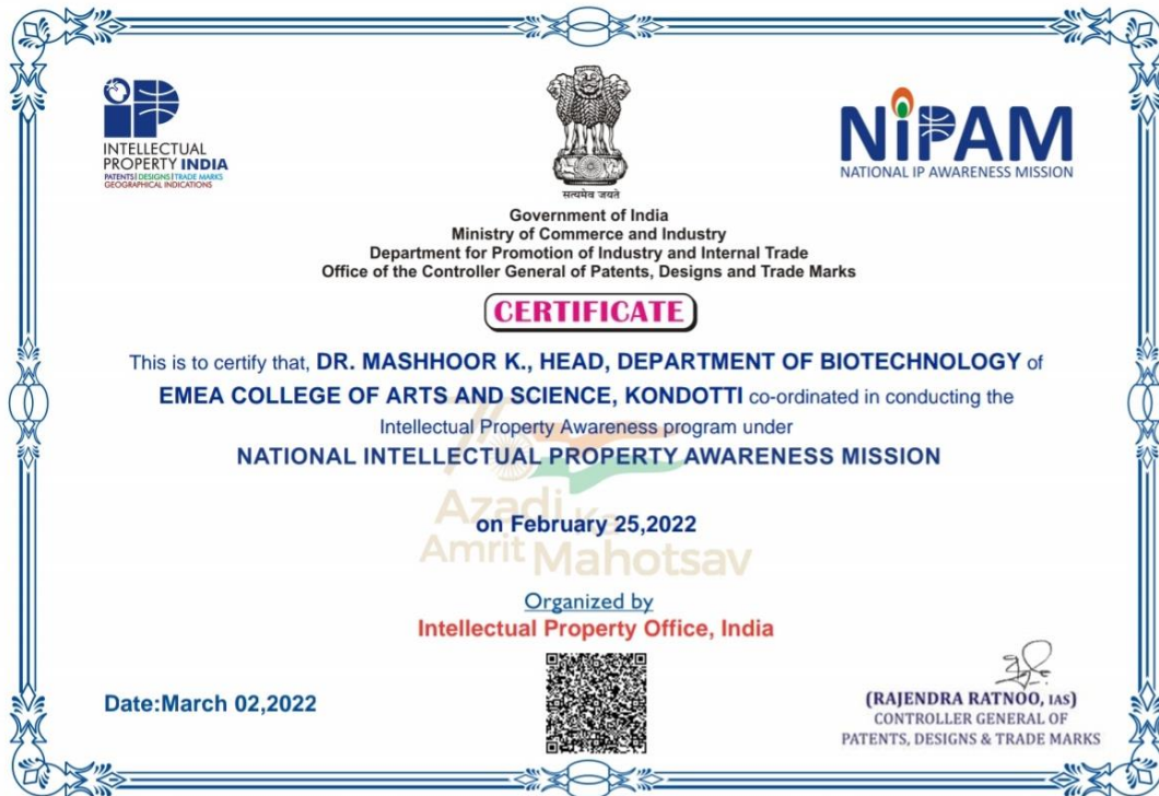
Certificate for coordinator