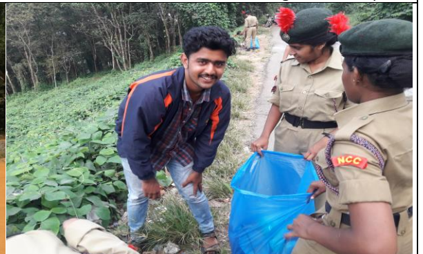
Swach Bharath CAmpaign at Mini Ooty