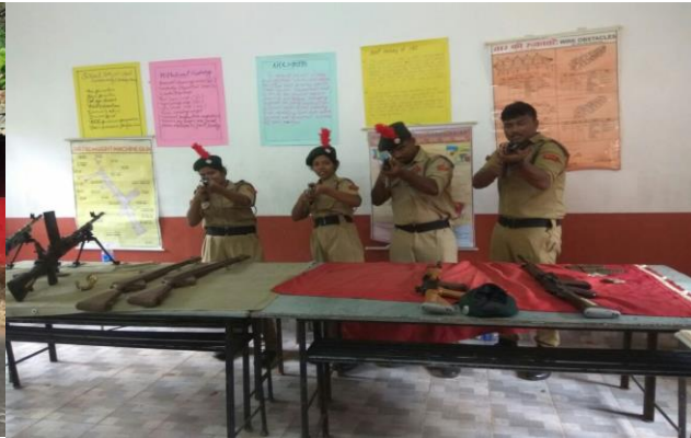
Army Weapon Awareness Camp