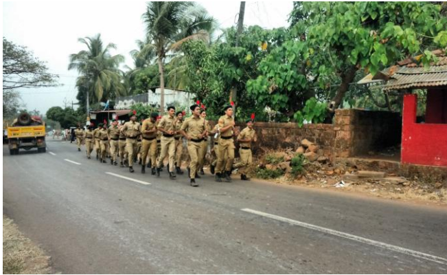
Anti Narcotic Day Run by NCC Cadets on 2 nd October 2017