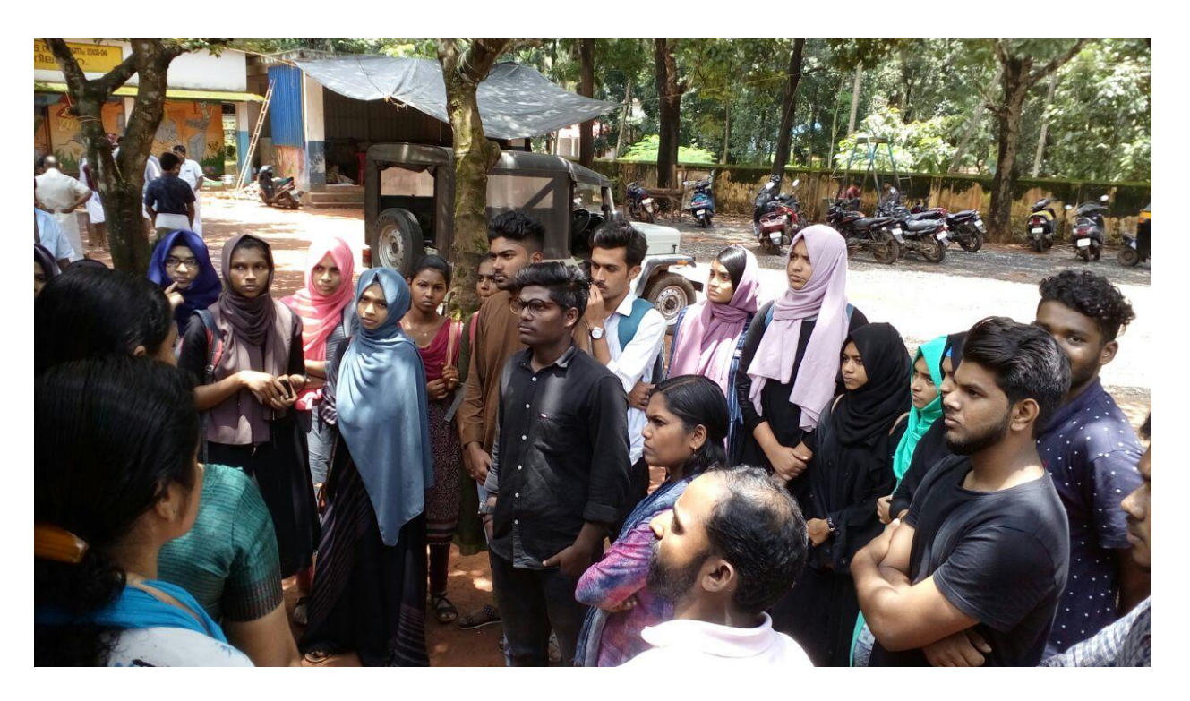
Members listening to the directions of the camp coordinator