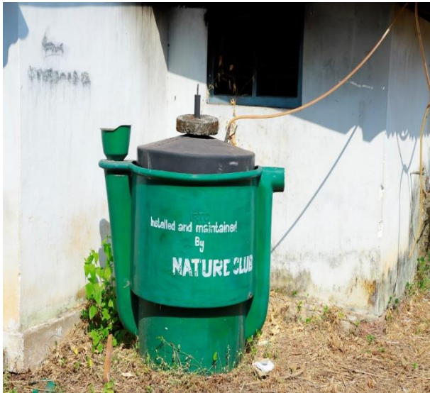
FIGURE 2: WASTE MANAGEMENT

Waste materials from the labs are neutralized and disposed in an identified area.